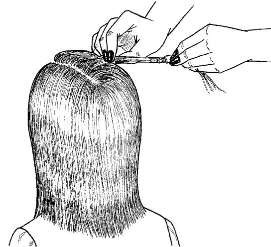
Remove the gum.